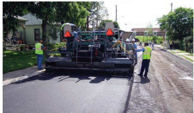
Treatment type analysis