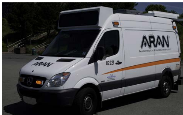
Fugro's Automatic Road Analyzer (ARAN)