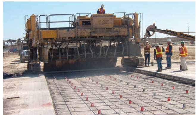
Pavement design recommendations

These core services not only allow agencies to improve their network conditions, but to comply with government regulations and improve their bond ratings. These regulations include GASB 34, ADA compliance, MAP-21, reflectivity, and others.