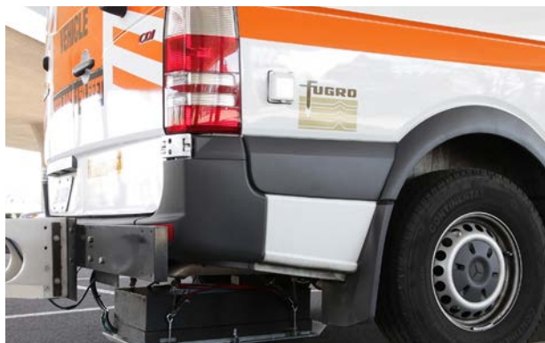
Ground Penetrating Radar (GPR)