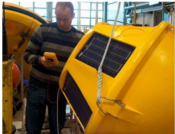
SEAWATCH Mini II buoy is configured before deployment