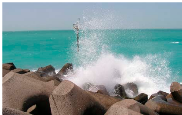
SEAWATCH Mini II buoy is used for coastal applications