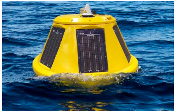
SEAWATCH Mini II buoy

Below the water surface it is spherically shaped to ensure optimal wave measuring capability. Above the surface the robust marine grade solar panels have been fitted in recesses for security. The wave sensor is a complete solid-state design with no moving parts.