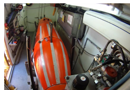
AUV ready for data recovery.