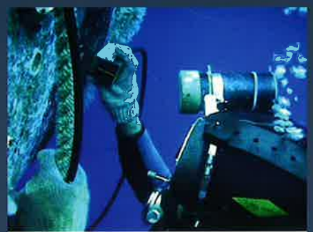
▲ Fugro Brasil Diver performing NDT inspection