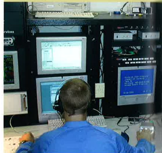
▼ SureSpek ISS Pty Ltd.

SureSpek, established in 1995, is an Australian based company operating mostly in the Asia Pacific region.