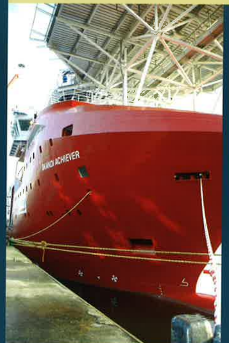
▼ Skandi Achiever

The ROV Lynx 23 on board the dive support vessel Skandi Achiever recently was test dived to 1,200msw and performed perfectly a credit to the offshore crew and engineers who installed the system. Fugro ROV Lynx 23 successfully completed work on the AD 6 project offshore Kakinada, India working in a diver and construction support role. The coastal city of Kakinada is located about half way up the East coast of India. Kakinada has been in the news recently after several oil companies have begun to use it as a transit point for oil and gas shipments as the city has a rapidly expanding deep-water port. It is reported activity in the area has further increased lately due to recent gas finds offshore by ONGC [Oil and Natural Gas Commission], and Reliance in the KG basin.