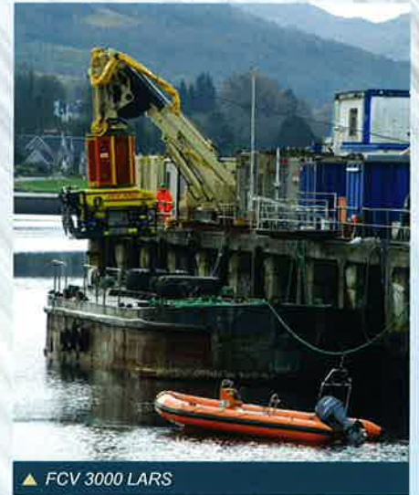
▲ FCV 3000 LARS

During a week long program, and despite the wind and rain, the FCV 3000 System underwent a full set of factory acceptance tests (FAT) on all of its advanced systems. The fine tuning that was completed on the sophisticated sub-systems and operating procedures could only be carried out when the individual components such as the crew, winch, LARS, hydraulic power pack, control cabin etc were gathered together in one location for the first time.