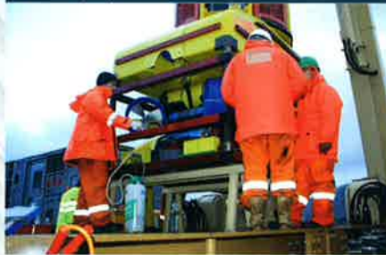
▼ Crew prepare FCV3000

Unlike most other seawater sites the sheltered waters of Loch Linnhe allow operations to continue in almost all weathers, an attribute that was used to the full given the time of year and the very inclement weather experienced during the trials, an aspect that was not lost on the ROV trials crew, who operated the System on a 24 hour per day shift system to maximise the water time during the trials.