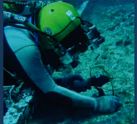
▲ Fugro Brasil Diver performing NDT inspection

Saturation Diving: Fugro has been working on board DSV Toisa Sentinel since 1994, in a successful partnership with Sealion Shipping. Contracts with Petrobras have been renewed continuously through mutual agreement or tender processes and a new 3 year contract was signed last month for an October start for which Fugro is providing 24 hr Saturation Diving, ROV operations and positioning services.