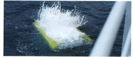
▲ G4 ROV heaves surface

Fugro-Rovtech mobilised the G4, 150hp, 4,000m ROV onto the multi-role vessel Siem Danis, together with an Argus Abyss ROV, which was to be used as a back-up system. The G4 was outfitted with special lights, cameras and positioning equipment for the project.