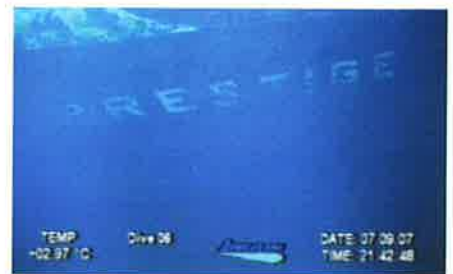
▲ Bow of Prestige

There were several objectives of the mission; firstly a video survey had to be carried out to evaluate the general condition of the hull, secondly, hull repairs and valve installations carried out during the cargo salvage operation in 2004 (during which time 14,000 Tonnes of oil was recovered) had to be checked and verified as still intact. The video footage will be used to determine the rate of corrosion of the hull. Finally, using containers designed specifically for the job, samples were extracted from areas of interest in the seabed around the wreck.