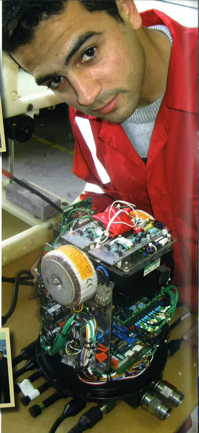
▲ Mohamed Aboue Elela

In Egypt, FSAE currently employ approximately 140 staff in both onshore and offshore roles. Well over 90% of the staff are locally hired with many of the Engineers and Technicians trained in-house via the Fugro Academy and cooperating ventures with local universities and technical colleges.