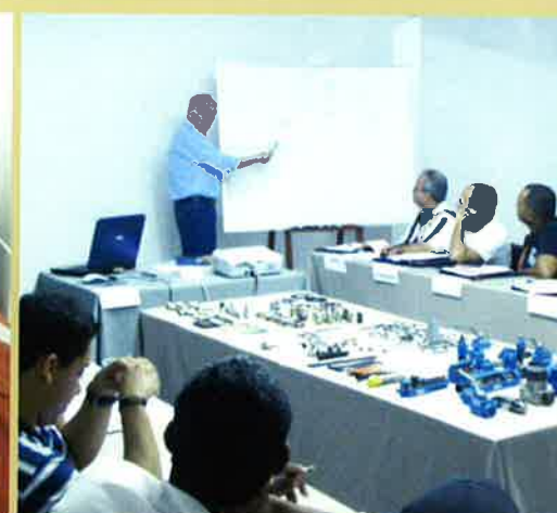
▲ Trainees and Staff undergoing training at Fugro Brasil offices