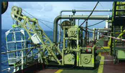
▲ Portable and retractable LARS

The Diving business line has a clear division between Air Diving (down to -50m depth, breathing air) and Saturation Diving (down to -350m depth, breathing a HELIOX mix, with the divers under pressure for 28 days at a time.