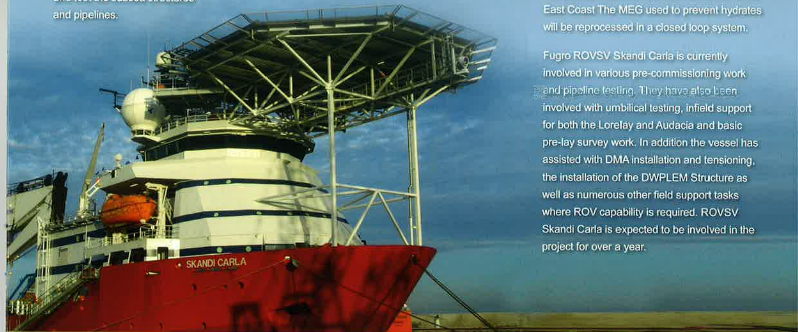
▼ Equipment and umbilical on the back deck of the Carla

Fugro ROVSV Skandi Carla is currently involved in various pre-commissioning work and pipeline testing. They have also been involved with umbilical testing, infield support for both the Lorelay and Audacia and basic pre-lay survey work. In addition the vessel has assisted with DMA installation and tensioning, the installation of the DWPLEM Structure as well as numerous other field support tasks where ROV capability is required. ROVSV Skandi Carla is expected to be involved in the project for over a year.