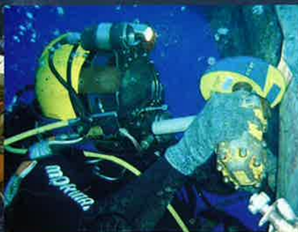
▲ Fugro Brasil Diver on maintenance job