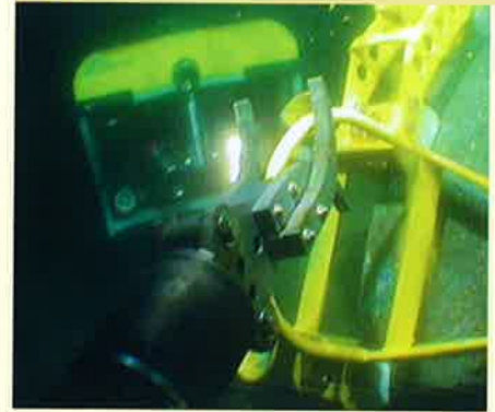
▼ Repair Tools

The compact size of this ROV allowed it to be installed on a platform with very limited deck space